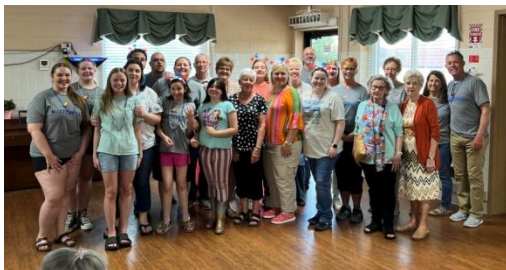
Speak & Serve at Landmark

More than 72 folks enjoyed Family Fun Day! Thanks to all who helped!